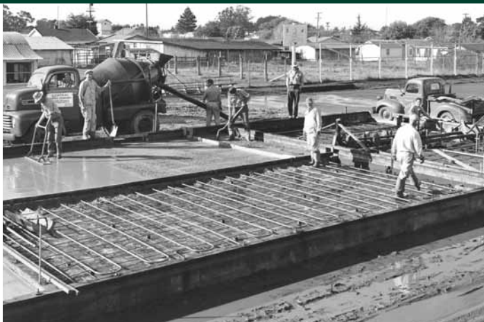
Building Live Oak School, 1951