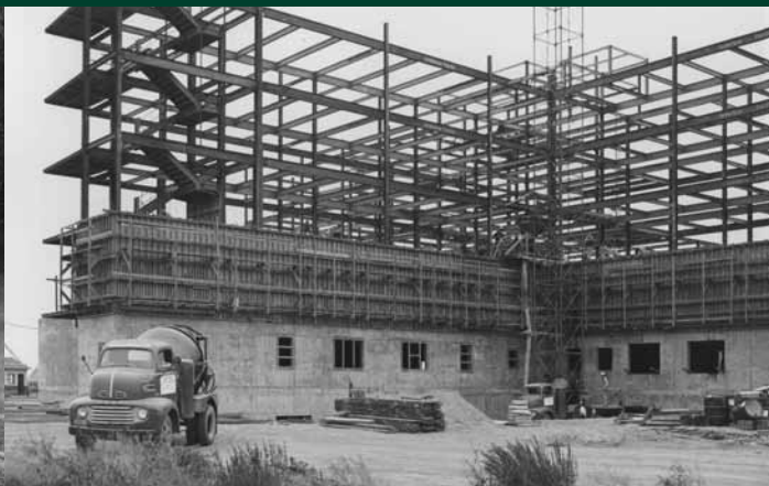
Building Salinas Memorial Hospital, 1951