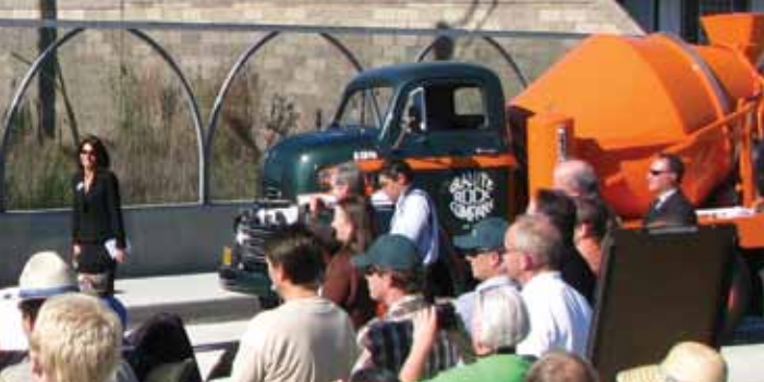
Highway 1/17 Project Ribbon Cutting Ceremony, 2009