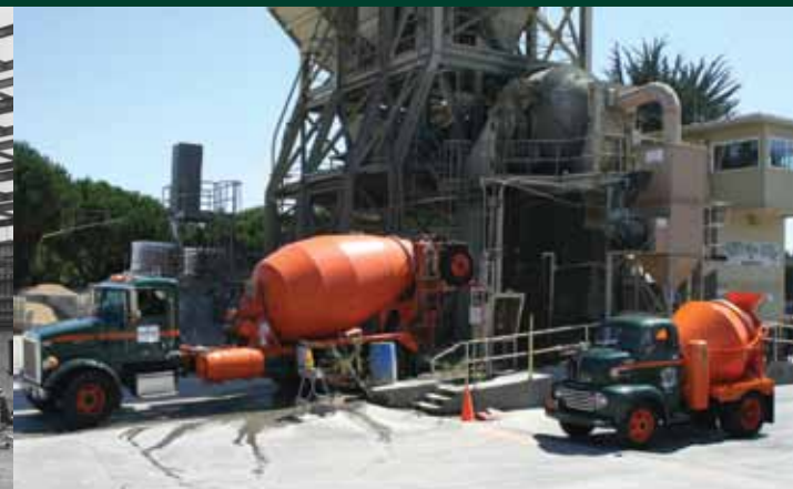
2009 Concrete Mixer compared to 1950 Concrete Mixer