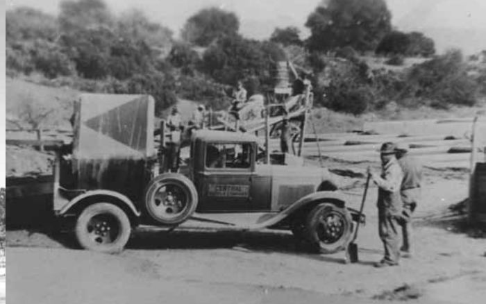
Delivering concrete to Corralitos water plant, 1930