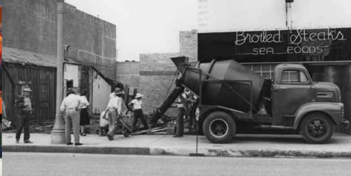
First day, first job, Salinas, 1950