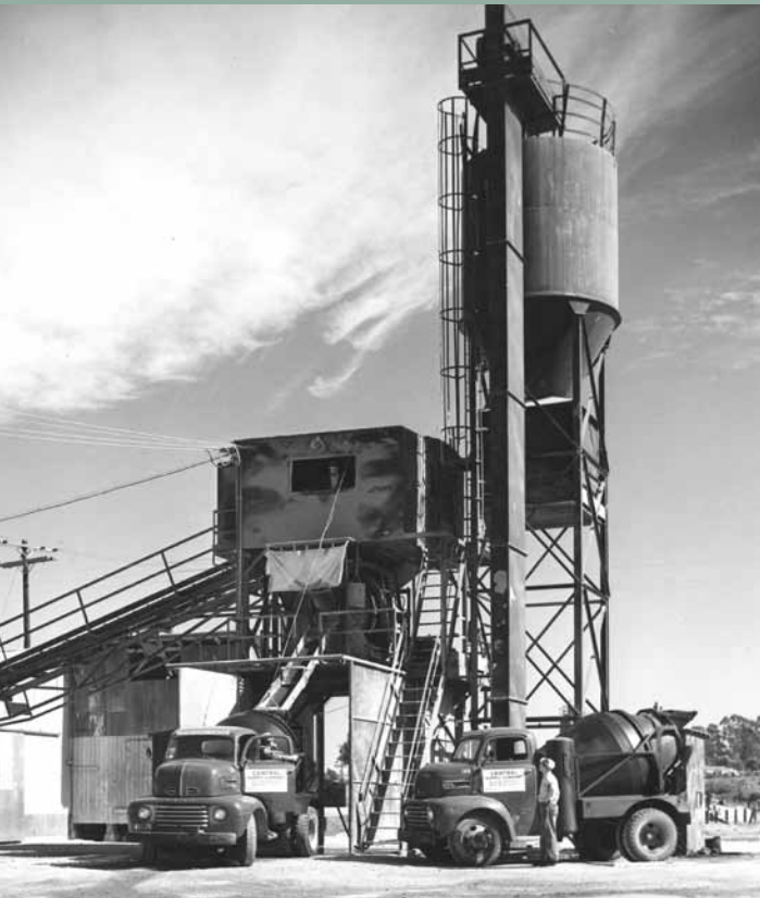
Graniterock concrete plant, 1951