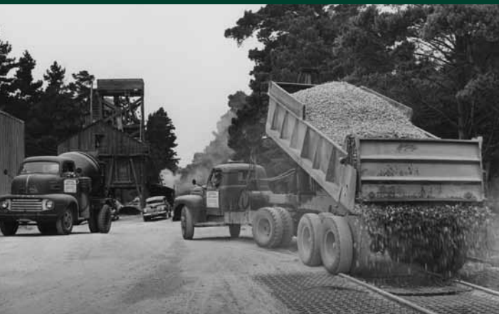
Crushed rock in – Concrete out, 1950