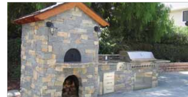
STONE VENEER: Blueriver Country Blend Mason/Landscaper: Landmark Landscapes