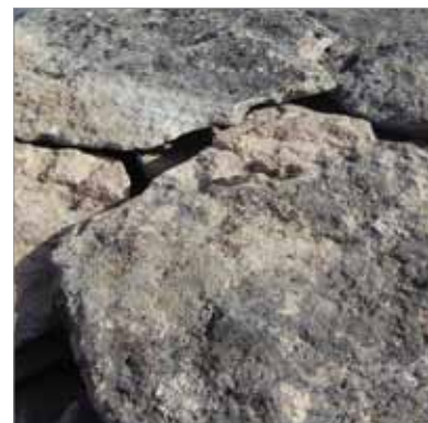
COLD WATER CANYON Available in: Flagstone, Slab/Fieldstone