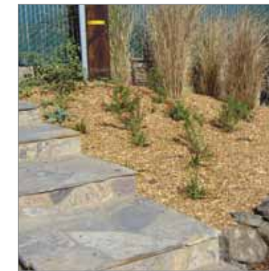
STAIRS: Three Rivers 1” Minus Flagstone