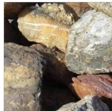
RAINBOW JASPER Available in: Wall Rock, Boulders