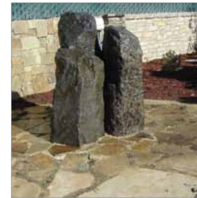
BACK WALL: Virginia Ledge, Camelback, Fondulac Rustic, Santa Cruz, Mtn Ash Blend Mason: Cornerstone Masonry