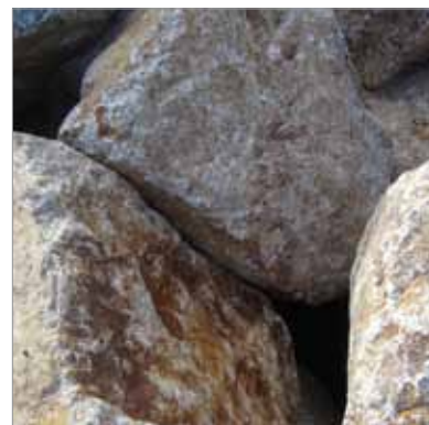
GOLDEN GRANITE Available in: Wall Rock, Boulders