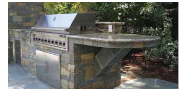
FLAGSTONE PATIO: Bluestone Select Full Range