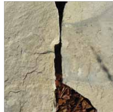
SANTA MARIA Available in: Flagstone