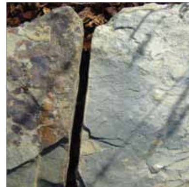
YOSEMITE Available in: Flagstone, Ledge stone