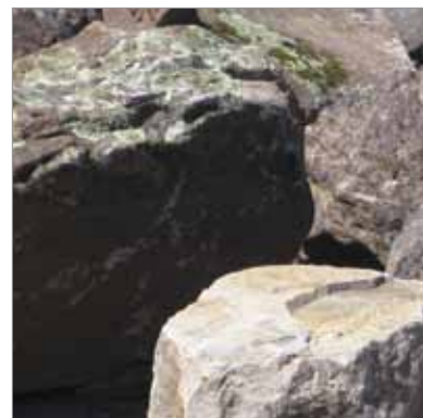
MOSS ROCK Available in: Wall Rock, Boulders