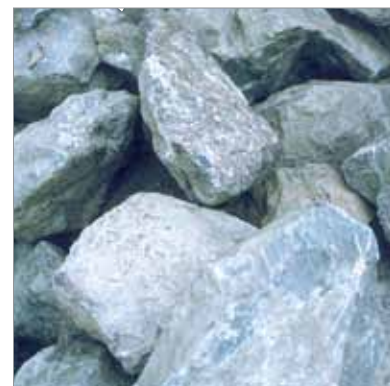
WILLOW CREEK Available in: Wall Rock, Boulders