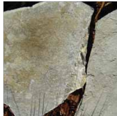
LOMPOC Available in: Flagstone, Wall Rock

In this day and age where trends are moving more and more to “Green” building practices, it is a benefit for you to at least know what options you have with natural stone. Below is a list of stones that are quarried in the Golden State of California.