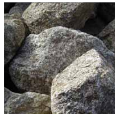
HOLLISTER GRANITE Available in: Wall Rock, Boulders