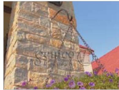
Blueriver Country Blend