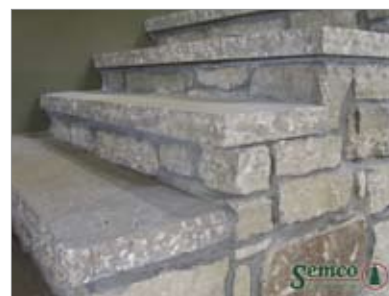
Cedar Ridge Treads

want thin veneer, full veneer, flagstone, cut tiles, wall caps, column caps, sills, hearths, mantels or anything else you can think of using stone for, Semco has the capabilities of making it happen with almost all of their unique stones. They can even go as far as specifying face heights on many of their thin and full veneer. For more information about Semco and their products contact the Monterey or Cupertino Design Center.