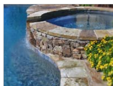
Black Hills Rustic Caps