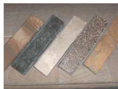
Semco Finishing Options