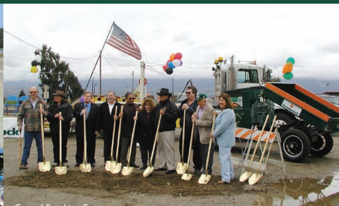
Ground Breaking Event