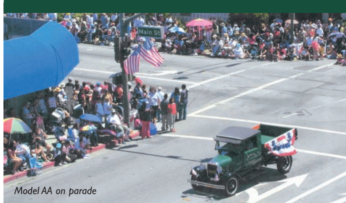
Model AA on parade