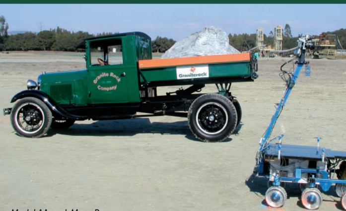
Model AA and Mars Rover